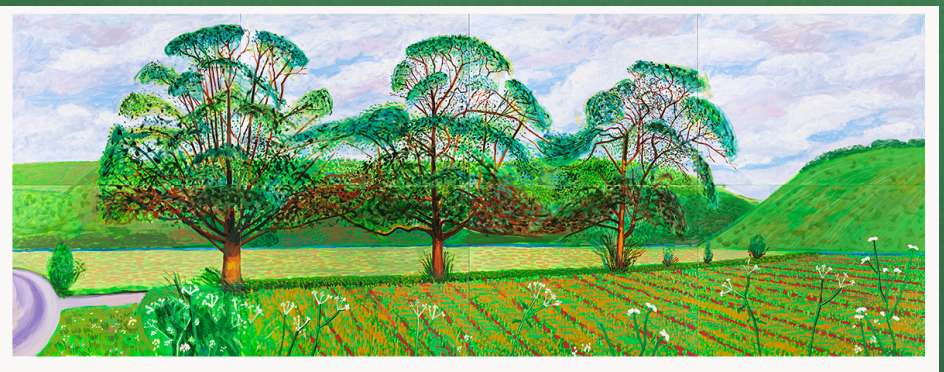
Three Trees near Thixendale, Spring 2008, 2008