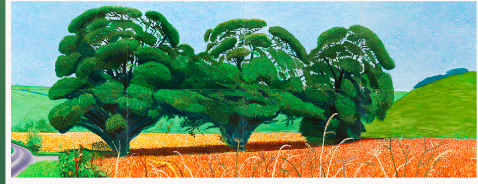
Three Trees near Thixendale, Summer 2007, 2007